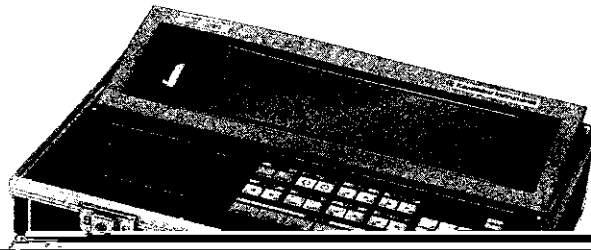
Photo 1 Appearance of MK-310,