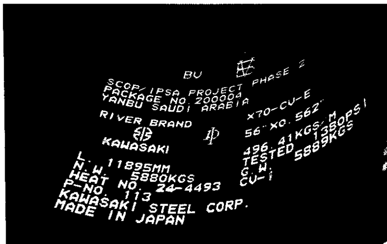
Photo 2 Marking on the inside surface

Pipe-end start position: 0 to 600 mm Host CPU: Fujitsu M3805 (for specification registration and preparation of pattern making) (Fujitsu Ltd.) Process CPU: TOSBAC 7/70E (for tracking) (Toshiba Corp.) Information relay device: Multi way (Nippon System Development Co. Ltd.)