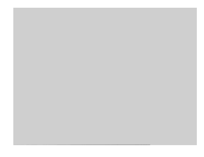
(B) Pail can end