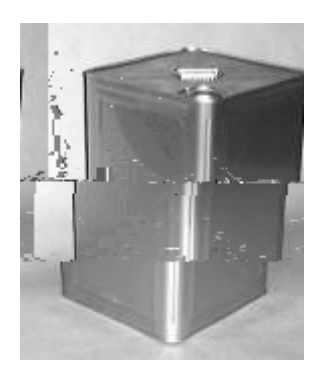
(A) 18L welding can

Materials Safety Techniques Association. (B) is an example of pail can end, laminated with the PP film inside and the white PET film outside, which makes possible clear and colorful printing. The film adhesion is high and the film does not peel off at the drawn circumference of the can end.