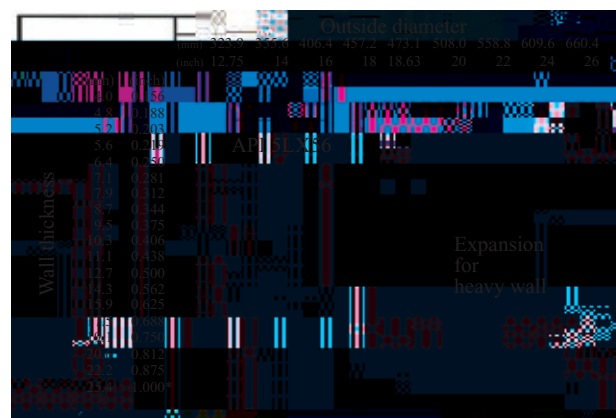
* ERW 1" wall thickness pipe: Only JFE Steel's 26" ERW mill can manufacture.

The 26" medium-diameter ERW pipe mill at JFE Steel's Chita Works is the only mill in the world which is capable of manufacturing ERW pipe with outer diameters up to 26". Therefore, taking advantage of this feature, Chita Works revamped its manufacturing